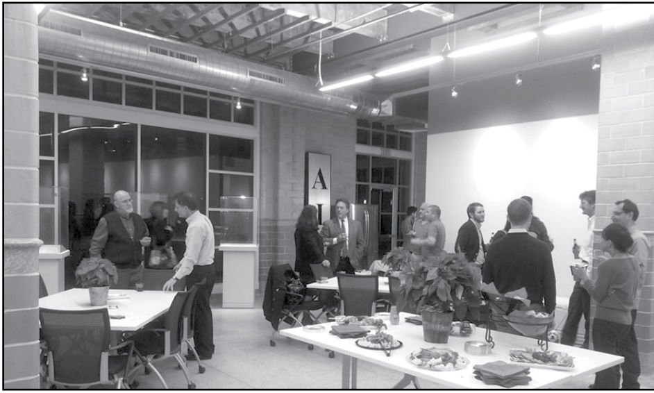
The week before Christmas, the AIA Center for Architecture held a soft opening event for the contributors to the new space.

Before the New Year, the American Institute of Architects (AIA) San Antonio Chapter moved to a new Center for Architecture. Formerly located at Pearl Brewery on East Grayson, the new center is at 1344 South Flores St., Suite 102.